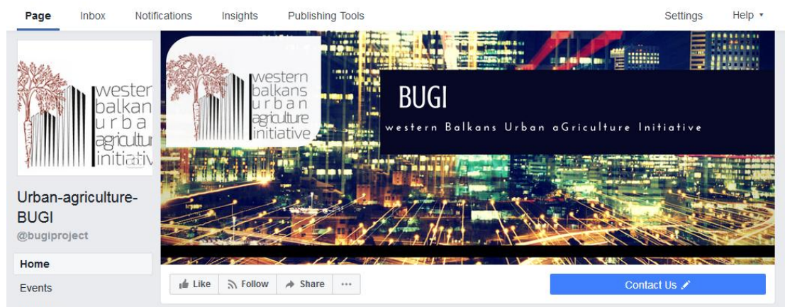
Picture 5. BUGI Project Facebook page

Project number: 586304-EPP-1-2017-1-BA-EPPKA2-CBHE-JP “This project has been funded with support from the European Commission. This publication reflects the views only of the author, and the Commission cannot be held responsible for any use which may be made of the information contained therein”